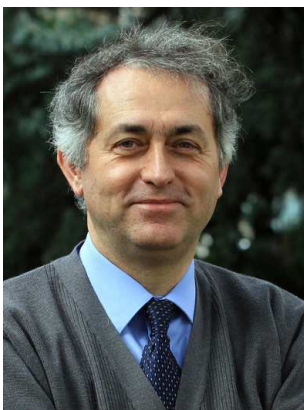
Professor of Marine Geology University of Barcelona SPAIN