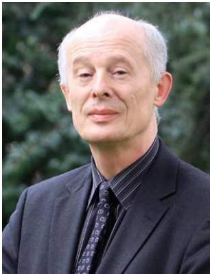
Director. Potsdam Institute for Climate Impact Research GERMANY

Hans Joachim Schellnhuber is Director of the Potsdam Institute for Climate Impact Research (Department of Physics, University of Potsdam, Germany). Chair of the Global Change Advisory Group for the Sixth Framework Program of the European Commission, he also serves on the corresponding panel for the Seventh Framework Program. He is a member of the Board of the Stockholm Environment Institute (Sweden) and of the Advisory Board of the Grantham Research Institute on Climate Change and the Environment (London School of Economics and Political Science). Among his many honors are the CBE (Commander of the Order of the British Empire) and 2007 German Environment Prize.