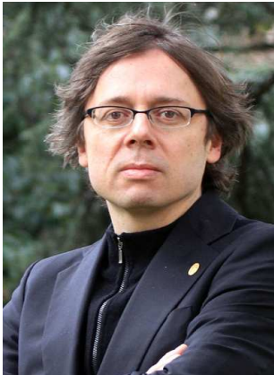
Director. Max Planck Institute for Meteorology GERMANY